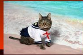
Pet Costume Contest

City of Sammamish is hosting a virtual costume and pumpkin contests for 2020!